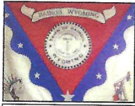
Lowell Clawson Mayor

Town of Batroil 1101 Antelope Drive PO Box 58 Batroil, WY 82322 307-324-7653 www.TownOfBatroil.com